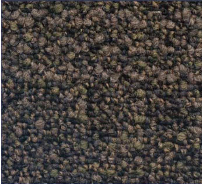
4109 Forest Floor 24"