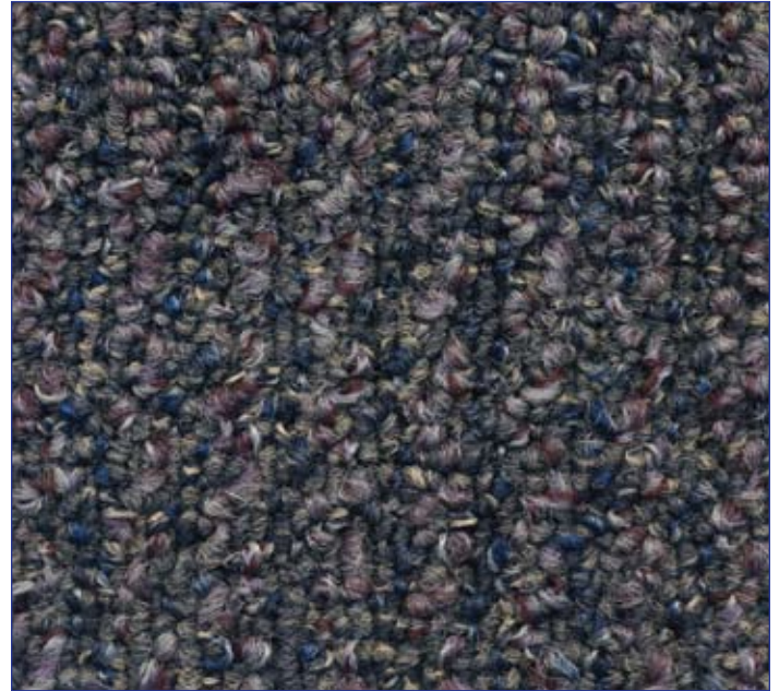
4111 Santa Fe Sunset 24"