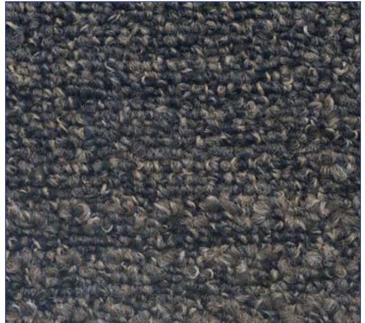
4112 Appalachian Trail 24"