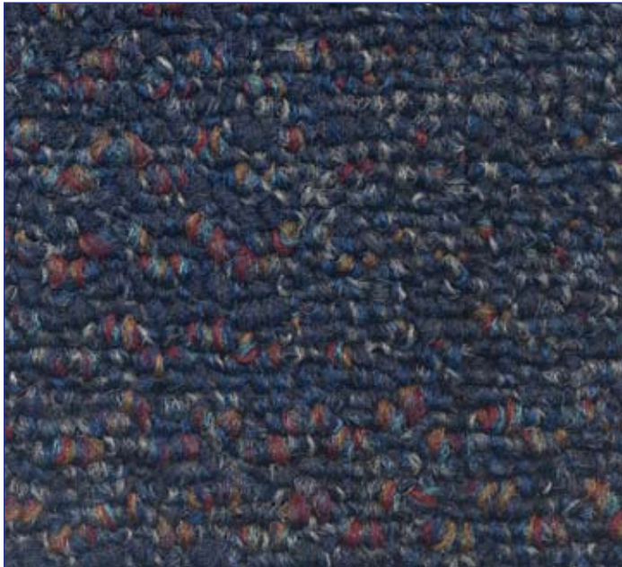
4110 Lake Tahoe 24"